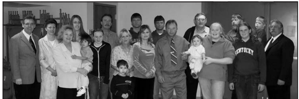
Pictured are the people that attended the first service on Easter Sunday at Dale, IN.

For several months myself and others have been praying, strategizing, and planning to plant a new church in our district. In our culture one of the best ways to reach new people for Christ is to start a new place for worship.