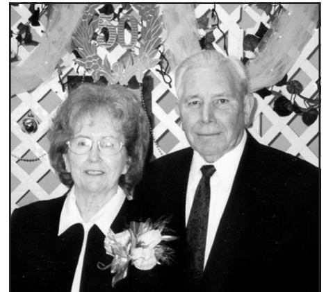
Celebrating 50 Years