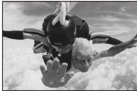
Celebrating 60 Years