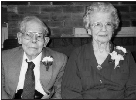
Celebrating 70 Years

This is Valentines Month. Listed below are some life-long sweethearts! Congratulations to these three couples for setting an example by staying married all these years to each other.